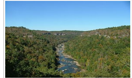
Big South Fork of the Cumberland River